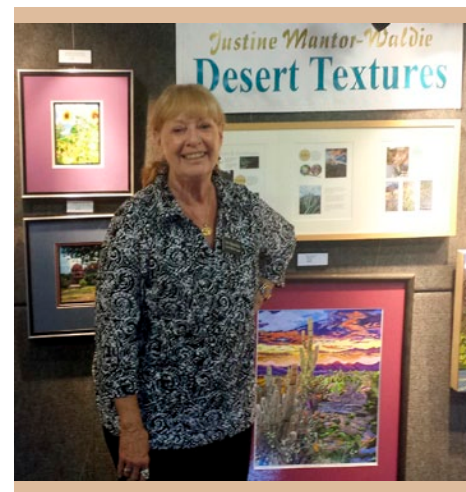
See you at “Hidden in the Hills”!