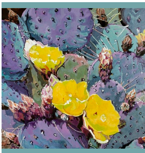
Purple Prickly Pears