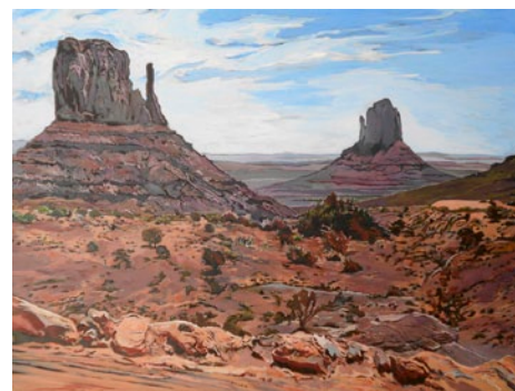
Monument Valley Mittens