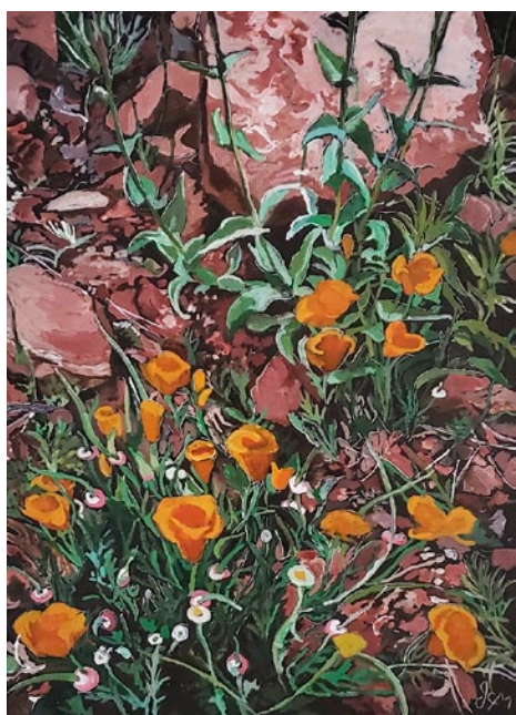
Copa de Oro

Justine will be exhibiting a variety of paintings on scratchboard, clay board and canvas with sizes from 4x6", 5x7" all the way to 16 x 20", 18 x 24" and 30 x 40". Her recent 5 x 7" " Copa de Oro " is a scene of golden poppies nestled among Sedona's red rocks. " Desert Twilight " is a larger painting created with the inks floating together in a method similar to watercolor floating technique. — See more previews of Justine's paintings on page 2.