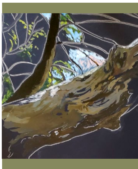
Second Red Rock Crossing painting