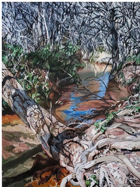
Red Rock Crossing: Spring Awakening