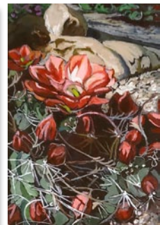
Vermilion Flower Buds