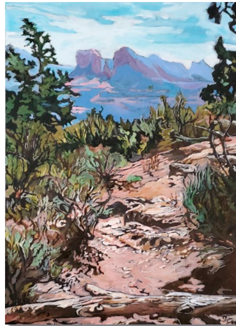
Path at Red Rock Crossing

for the Hidden In The Hills Online Directory , & downloadable Studio Tour Map & Artist List!