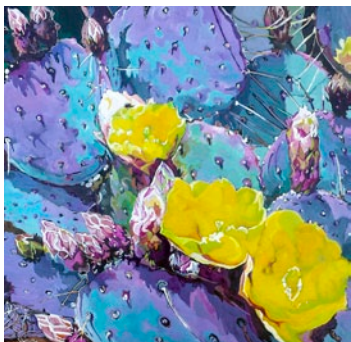
Prickly Pears Aglow

While at Studio 3 , see Justine's newest paintings, a pair of flowery desert delights!