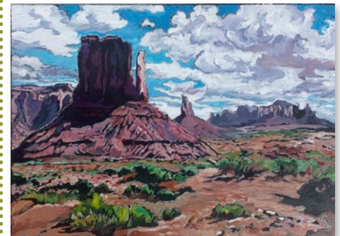
Monument Valley: Shadow Mitten