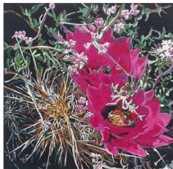
Desert Flower Dance