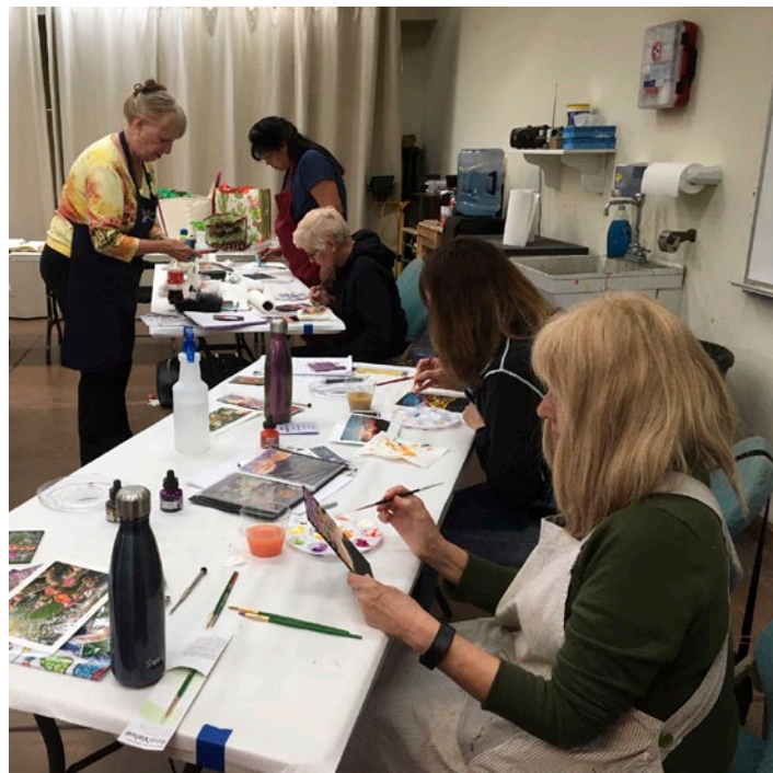
Students enjoy the art experience at Sedona Arts Center

Conte crayon, etching tool, palette, brushes along with Justine's huge stash of inks and pearlescent inks, and students go home with 3 scratchboard paintings; 3x5", 5x7", and 9x12"