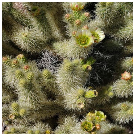
Teddy Bear Cholla

Spring came to the desert with a loud cacophony of colors. Our winter was the wettest in years producing a spring "Super Bloom." Justine ventured out to photograph the flowers along the road to Saguaro Lake, only to find thousands of people had the same idea. The hills were alive with thousands of yellow and gold poppies. It was exciting to mix with the crowds and cars. This spring has also brought out a multitude of cactus blooms. ✱ It was the first time Justine has seen a "Teddy Bear Cholla" in bloom.