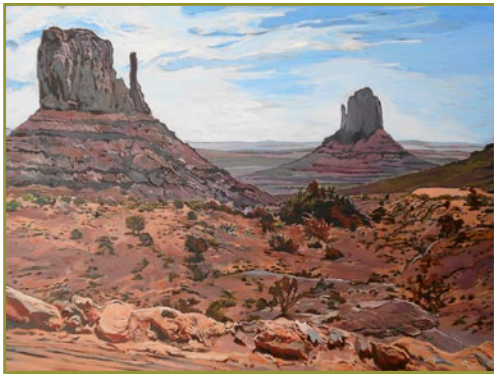
Monument Valley: Mittens View