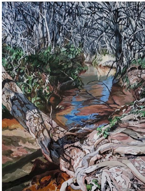
Red Rock Crossing: Spring Beginnings

"A painting can be experienced as a single moment in time. Paintings can be experienced as alive and changing with every moment; that is what your paintings mean to me. Your paintings bring life into a home to enjoy over and over ..."