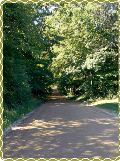
Bear's "cave" road