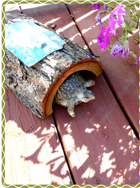
Squirtle's new bark tunnel